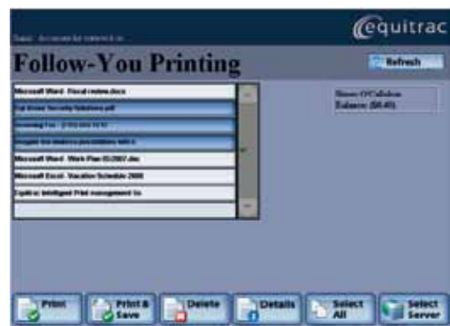
User Interface only available on ApeosPort devices

Let's face it, a paperless office would be difficult to achieve. Paper still remains to be the preferred way to convey information. It is easy for your staff to just hit the print button without realising that money, time and resources may be wasted for every document queued at the network printer.